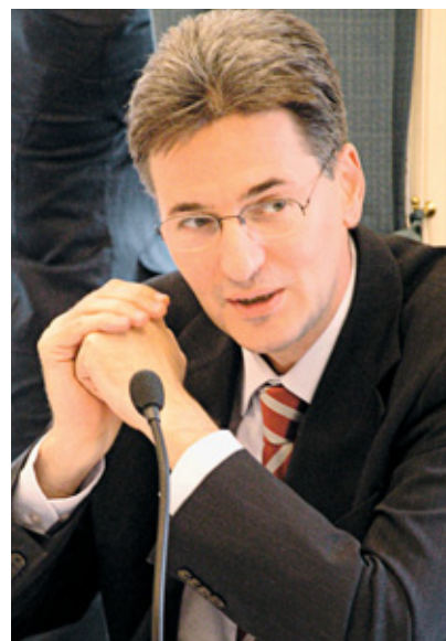
Leonard Orban, European Commissioner for Multilingualism

I hope you enjoy reading this brochure. It is a testimony to all the hard work and tremendous enthusiasm which have gone into producing this excellent work. These projects have already had a positive impact on in the daily life of thousands of European citizens and I feel sure they will provide a source of inspiration for future project promoters.